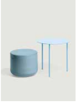
Pastel blue (RAL 5024) Pastel blue (RAL 5024) or Metal: Sand blasted steel