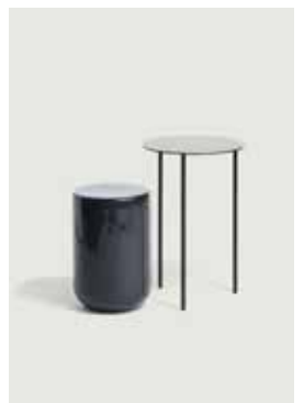
Ceramic: Black (RAL 9005) Metal: Black (RAL 9005) or Metal: Sand blasted steel