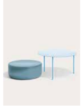
Ceramic: Pastel blue (RAL 5024) Metal: Ochre (RAL 1020) or Metal: Pastel blue (RAL 5024) or Metal: Sand blasted steel