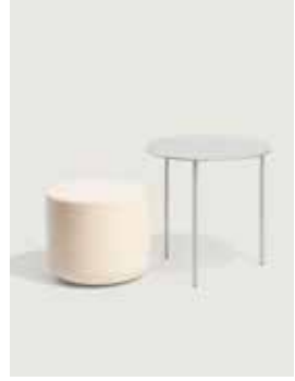
Light ivory (RAL 1015) Metal: Sand blasted metal or Metal: Light ivory (RAL