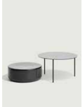
Ceramic: Black (RAL 9005) Metal: Black (RAL 9005) or Metal: Sand blasted steel