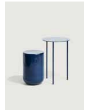
Steel blue (RAL 5011) Metal: Steel blue (RAL 5011) or Metal: Sand blasted steel