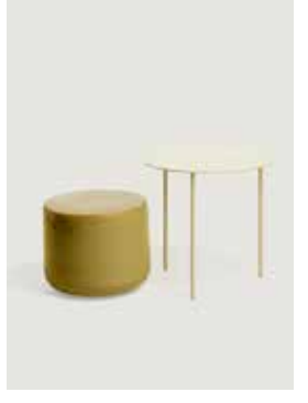
Ochre (RAL 1020) Ochre (RAL 1020) or Metal: Sand blasted steel