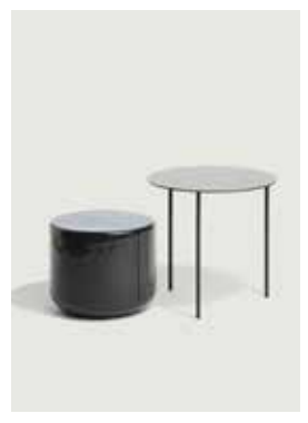
Ceramic: Black (RAL 9005) Metal: Black (RAL 9005) or Metal: Sand blasted steel