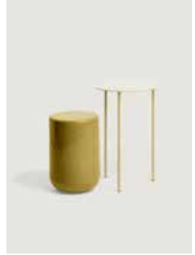
Ceramic: Ochre (RAL 1020) Metal: Sand blasted steel