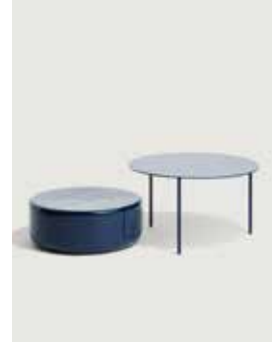
Ceramic: Steel blue (RAL 5011) Metal: Steel blue (RAL 5011) or Metal: Sand blasted steel