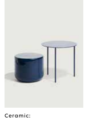
Steel blue (RAL 5011) Steel blue (RAL 5011) or Metal: Sand blasted steel