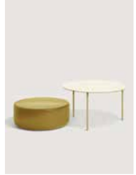
Ceramic: Ochre (RAL 1020) Metal: Sand blasted steel