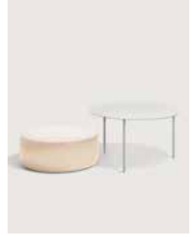
Ceramic: Light ivory (RAL 1015) Metal: Sand blasted metal or Metal: Light ivory (RAL 1015)