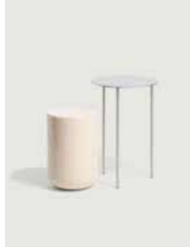
Light ivory (RAL 1015) Metal: Sand blasted metal or Metal: Light ivory (RAL 1015)