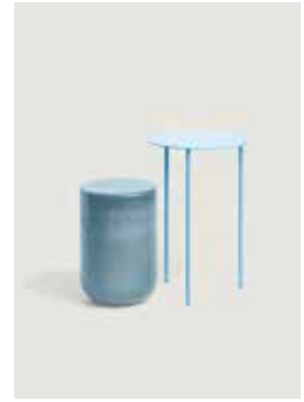
Ceramic: Pastel blue (RAL 5024) Metal: Ochre (RAL 1020) or Metal: Pastel blue (RAL 5024)or Metal: Sand blasted steel