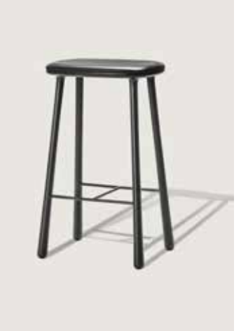
Frame: Black lacquered oak Seat: Black leather