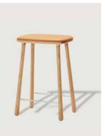
Frame: Olied oak Seat: Sand leather