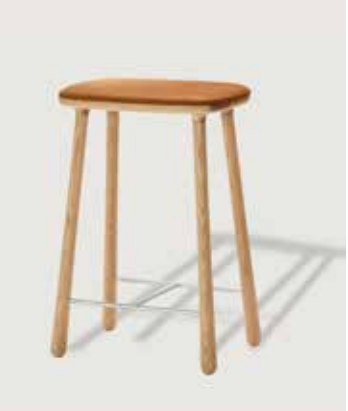
Frame: Olied oak Seat: Cognac leather