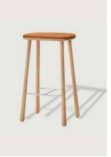
Frame: Olied oak Seat: Cognac leather