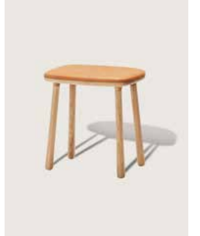
Frame: Olied oak Seat: Sand leather