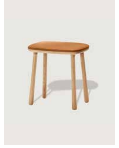
Frame: Olied oak Seat: Cognac leather