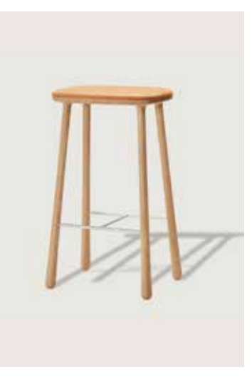
Frame: Olied oak Seat: Sand leather