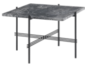
TS COFFEE TABLE SQUARE 80x80 - Photo coming

TS COFFEE TABLE SQUARE 55x55, TS COFFEE TABLE SQUARE 80x80, TS COFFEE TABLE SQUARE 105x105, TS COFFEE TABLE SQUARE 130x80