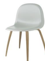
// Nightfall Blue