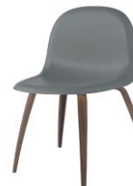
// Rainy Gray