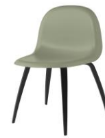
// Mistletoe Green