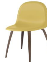
// Venetian Gold