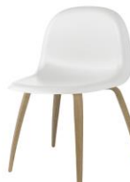
// White Cloud