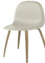
// Moon Gray