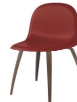
// Shy Cherry