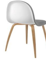
// White Cloud