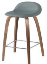
// Rainy Gray