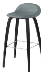
// Rainy Grey