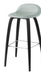
// Nightfall Blue