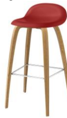
// Shy Cherry