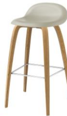
// Moon Grey