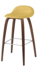
// Venetian Gold