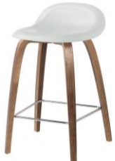
// White Cloud