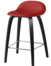
// Shy Cherry