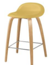
// Venetian Gold