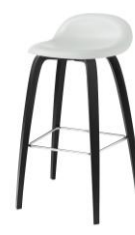
// White Cloud