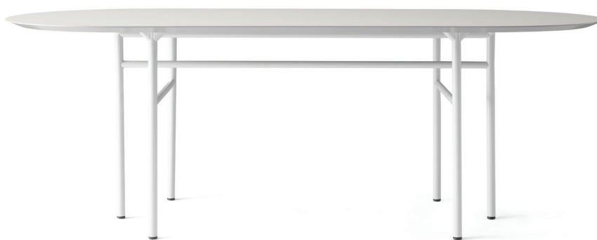
Light Grey / Mushroom 1151689