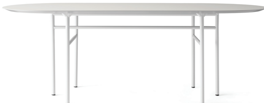
Light Grey 1151139