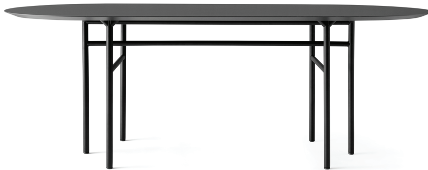
Black / Charcoal 1151149