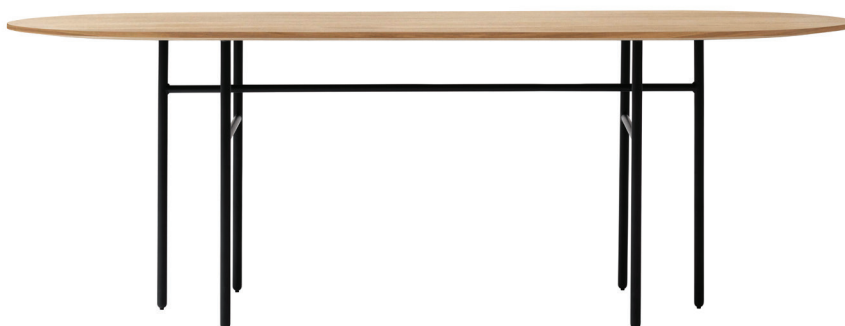
Solid Oak 1141539