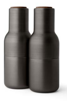
Bronzed Brass 4415859