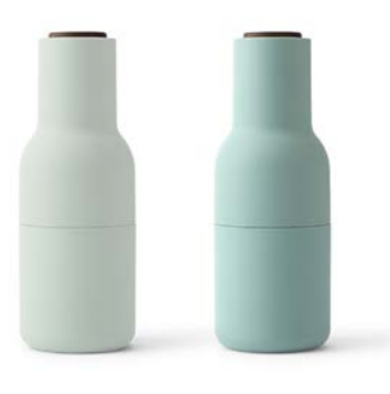
Moss Green 4418869