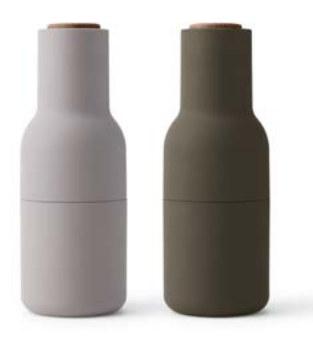
Hunting Green/Beige 4418459