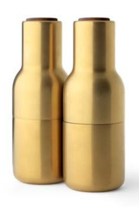
Brushed Brass 4415839