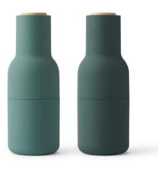
Dark Green 4418479