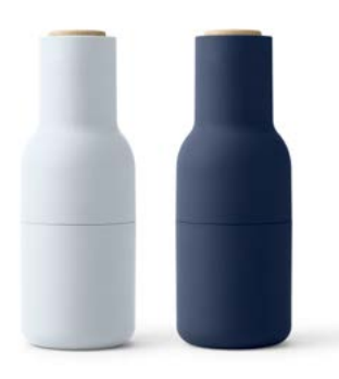
Classic Blue 4418719