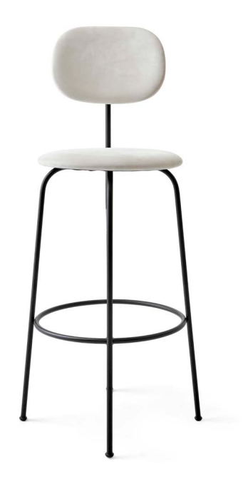
Afteroom Bar Chair Plus