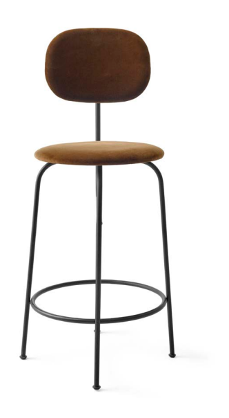
Afteroom Counter Chair Plus